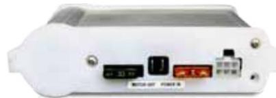
Replaceable automotive style fuses.