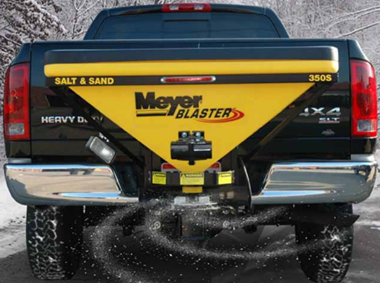
Shown with optional halogen rear work and brake lights. Part #34610