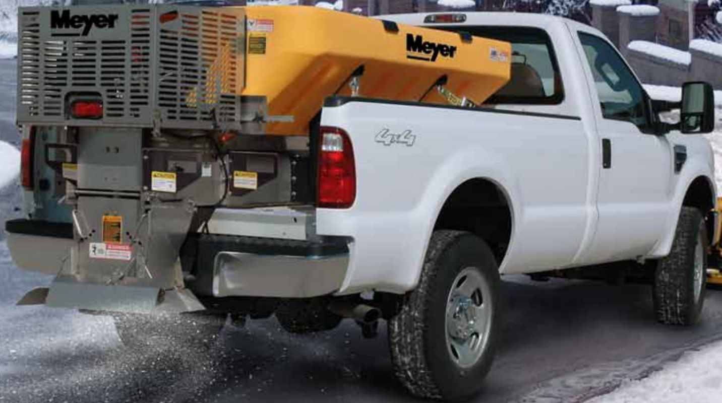
Polyhawk shown with optional equipment.