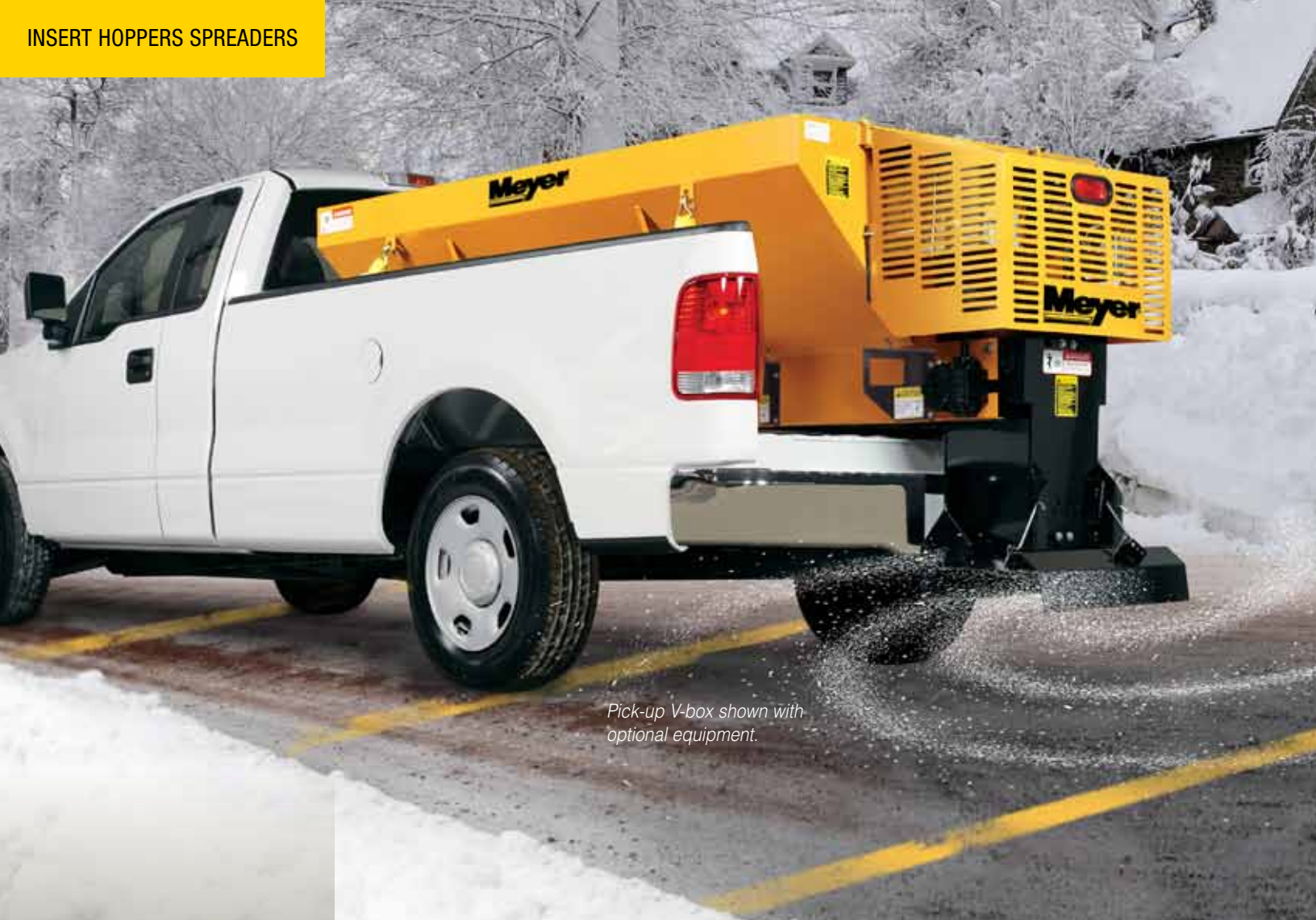
Pick-up V-box shown with optional equipment.