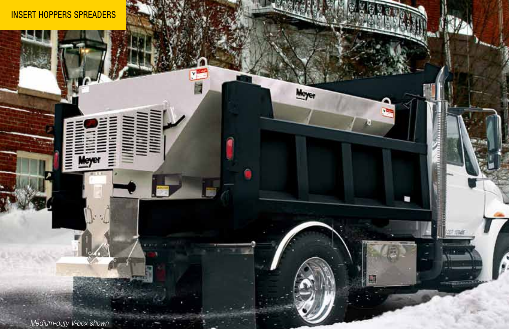
Medium-duty V-box shown with optional equipment.