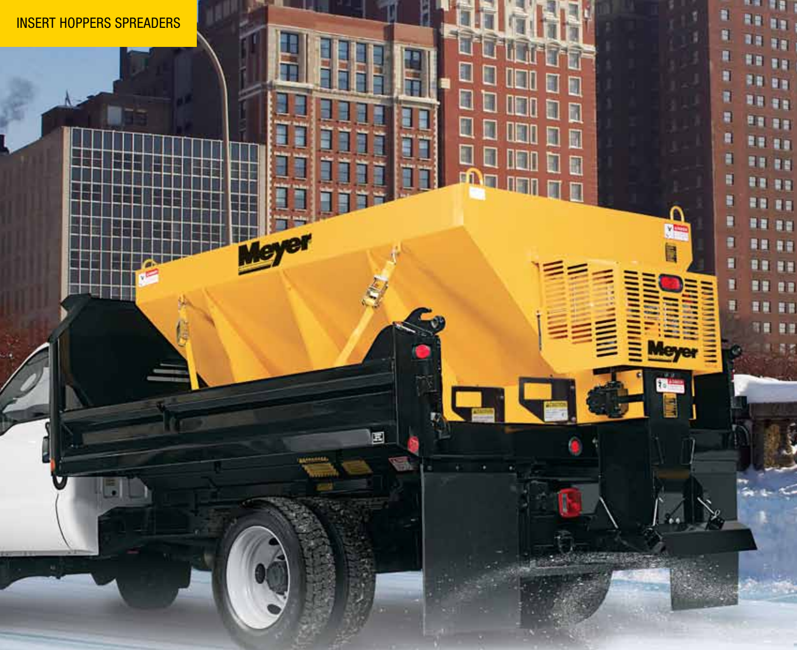
Medium-duty V-box spreader shown with optional equipment.