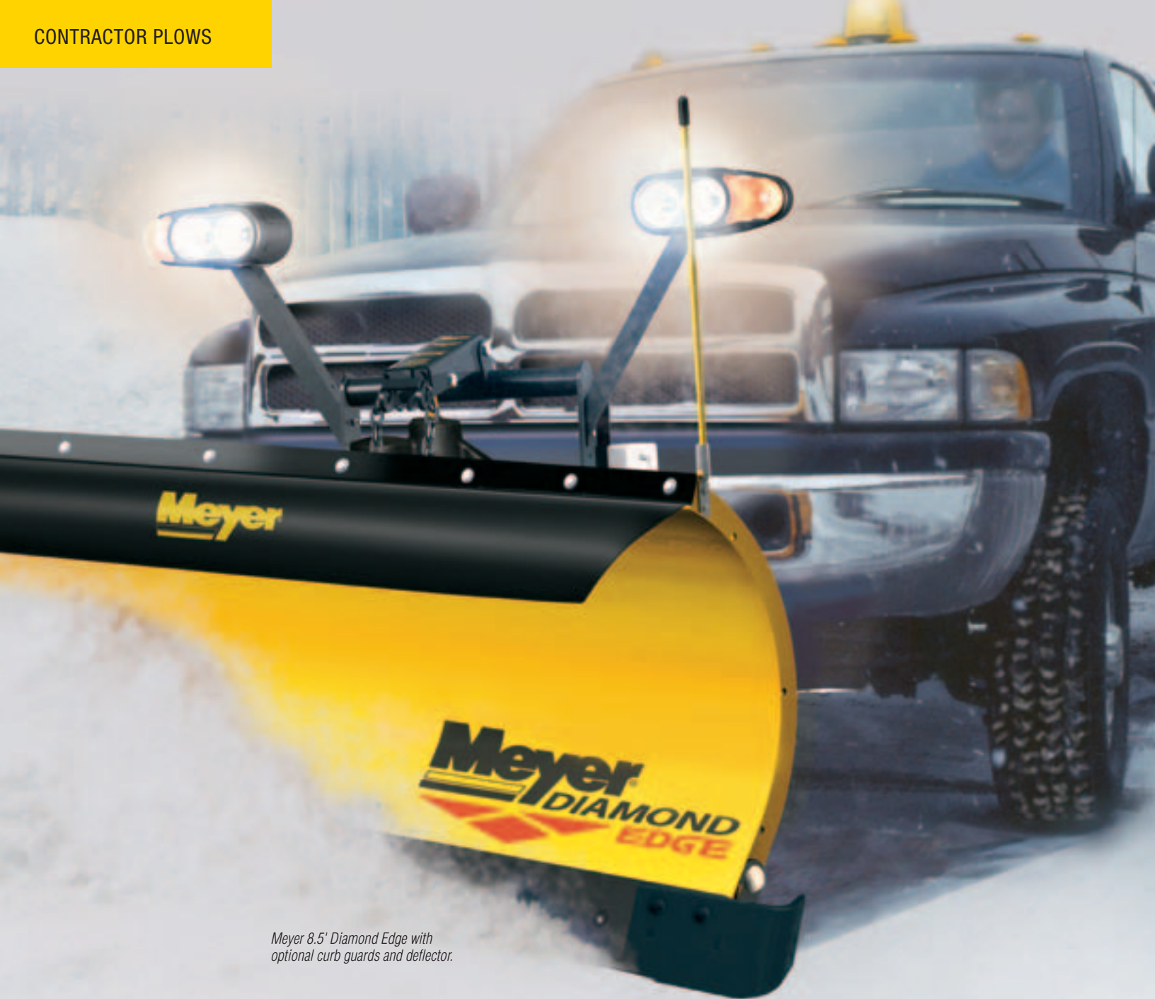
Meyer 8.5' Diamond Edge with optional curb guards and deflector.